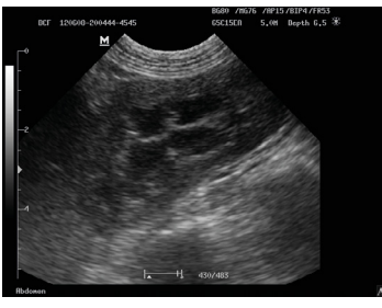
Canine Kidney Longitudinal with 5.0-8.5 MHz